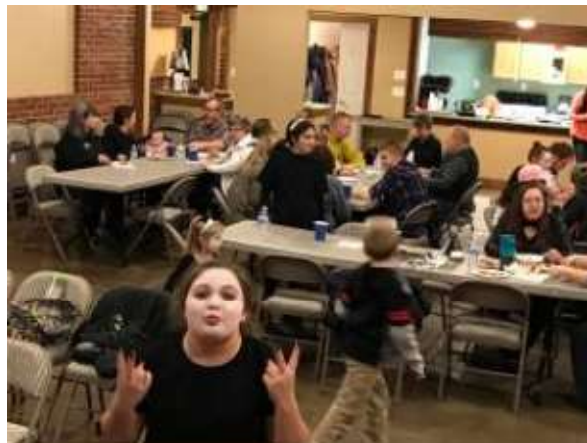
No party is complete without good food and good fellowship.