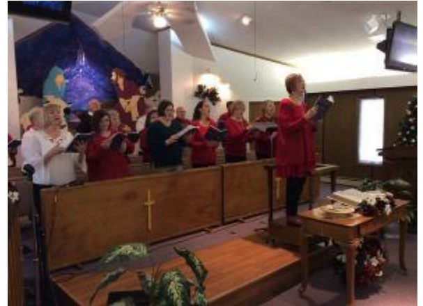
This photo of the Redeemer Baptist Church choir appeared on the front page of the Anderson Herald Bulletin on Christmas Day. A newspaper reporter attended the Christmas Eve service and wrote about this holiday service.