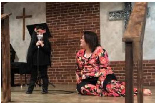
“Cher” and her mini me.