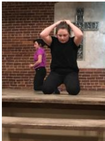
The Talent Show included serious as well as funny presentations.